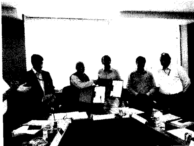
Signing of MOU between AICTE and Internshala on 27-04-2017 at AICTE Headquarters, New Delhi